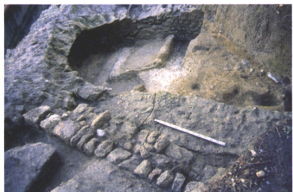
Figure 2: Left: drilling equipment installed in the internal gallery (ambulacrum). Right: Radial wall with masonry.

Mineralogical and geochemical investigations of this site have been conducted in order to characterize the water-rock interactions that have affected the mortar. Several investigation tools were used for this purpose: